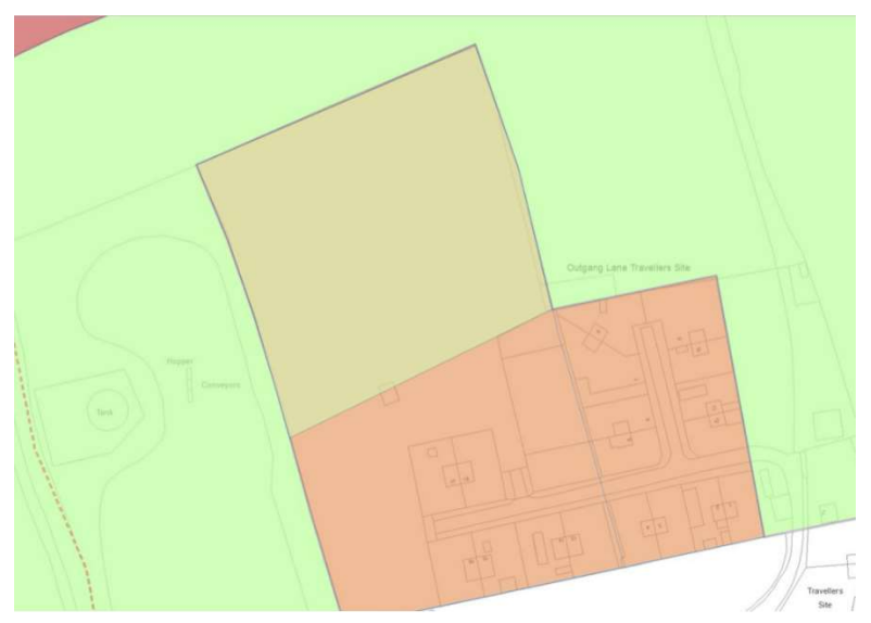
Figure 5: Proposed policy map modification December 2022 (For illustration purposes only)

4.8 A revised modification based on the above would ensure the Council owned site at Osbaldwick has capacity to deliver the 4 pitches identified as part of the CYC provision and the likely additional requirements generated through development of some of the Plan's allocated sites. It is an approach that provides flexibility and secures a requisite level of certainty that future pitch needs can be met.